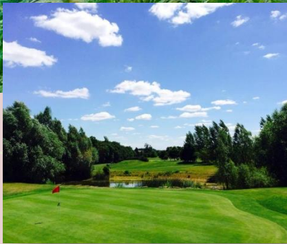
6th Hole Local Rule