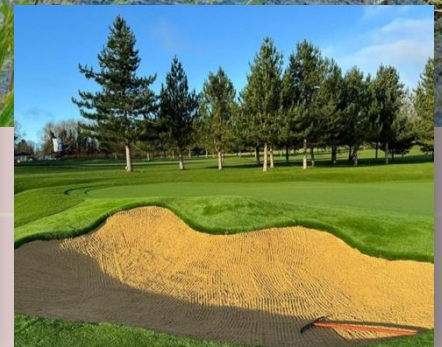
James Ridyard Short Game Area