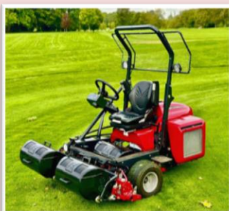
New Baroness 'state-of-the-art' Greens Mower purchased last year

The adverse winter weather has allowed us to focus on jobs such as clearing ditches and hedges, renovating bunkers, improving pathways etc.