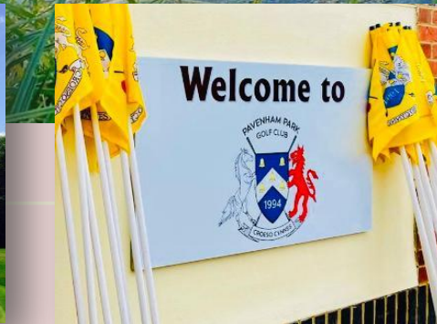
New Booking Procedures